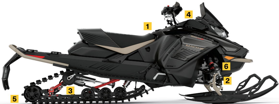
MACH Z™ 900 ACE™ TURBO R SHOWN

1.5 in. lower ride height for improved aerodynamics, lower center of gravity, more traction due to a better attack angle of the track and an aggressive look.