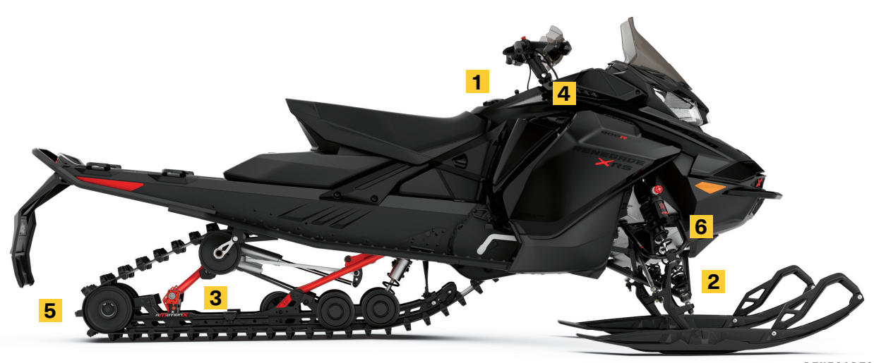
RENEGADE® X-RS® WITH COMPETITION PACKAGE SHOWN

Competition-ready with reinforced rails and rear suspension plus heavy-duty track tensioner, acceleration link rods and arm extension.