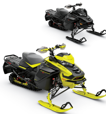
RENEGADE® X-RS® 900 ACE® TURBO R SHOWN