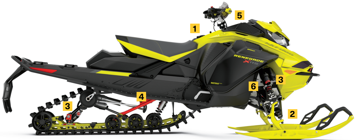
RENEGADE® X-RS® 850 E-TEC® SHOWN

An industry-first, Smart-Shox semi-active suspension instantly reads terrain and rider input to automatically dial in your suspension to give you the optimal ride in any conditions.