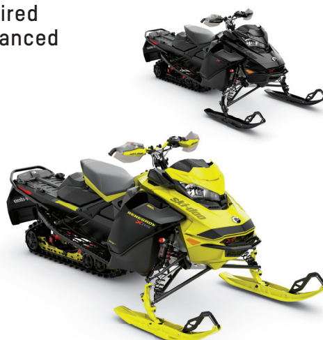
RENEGADE® X-RS® 850 E-TEC® SHOWN

A hard-charging, race-inspired machine with the most advanced features and technology.