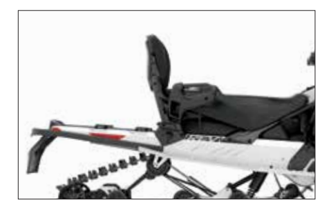
2-up seat with removable LinQ passenger backrest and handholds

Sculpted to offer improved rider and passenger wind deflection.