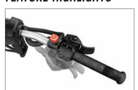
Finger throttle position

Throttle block can be rotated to be used as either a traditional thumb throttle or unique finger throttle.