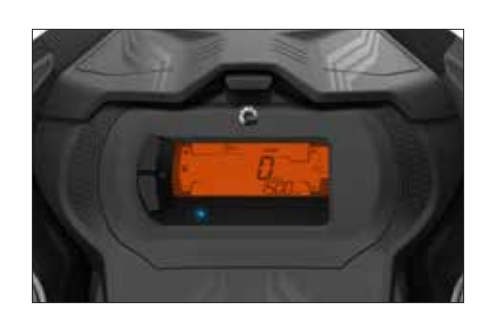
4.5-in. digital display

Easily remove or install the passenger backrest and handholds with the LinQ system.